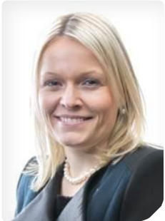
Liv Garfield Chief Executive Officer

Liv has been the CEO at Severn Trent since April 2014. Before joining the company, Liv was the CEO of Openreach, the access infrastructure arm of the BT group, for three years, following eight years in a variety of roles within BT, including four years as Group Director of Strategy and Regulatory Affairs. Before joining BT, Liv worked for Accenture as a consultant in the Communications and High Tech Market Unit, designing and implementing business change solutions across a number of industry sectors. Liv, a life-long Everton fan, is 39, from Harrogate in Yorkshire, and is married, with two boys.